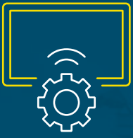
Image Processing Engine (IPE)

Streamline and Automate Image Processing With a Comprehensive Analysis Solution