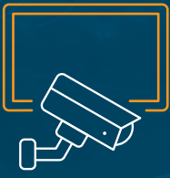
Image Quality Detection (IQD)

Proactively Identify and Address Camera Quality Issues With an Early Warning Image Analysis Solution